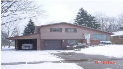
293 Cadman (Village)