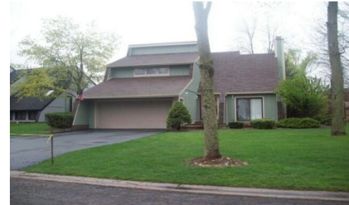
152 Brockmoore (Town)